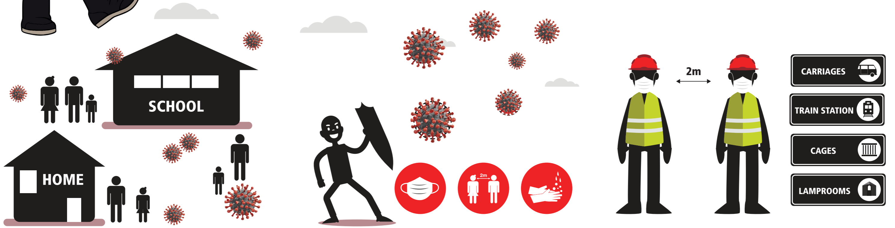
The spread of Covid-19 within our operations, homes and communities is a reality.